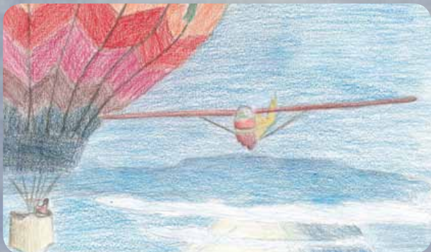
1st Place Winner - Junior, USA

Now, it's your turn to think about all the ways people travel through the sky with the power of the wind alone. Grab your favorite colored pens, pencils, or paint and create a poster celebrating the wonder that is Silent Flight.