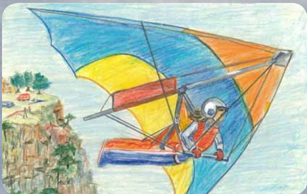
3rd Place Winner - Junior, USA

Once received, entries become (and remain) the property of the State Sponsor and may be used for a variety of purposes. Those forwarded for international judging become (and remain) the property of the Federation Aeronautique Internationale (FAI).